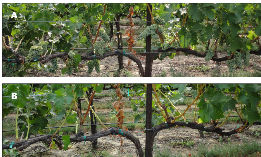
Figure 2. A) Vitis vinifera 'Sauvignon blanc' vine prior to destructive cluster collection. B) The same vine after removal of all clusters. This whole-vine cluster collection can be used to determine average cluster weight, but is not recommended in non-uniform vineyard blocks.

The annual variation seen in yield estimation is most often attributed to using different methods to calculate cluster numbers (70%) and weights (30%) (Dami 2006). If yield estimates fluctuate more than an acceptable level (5–15% according to industry