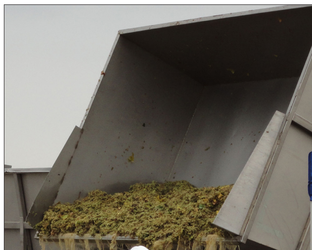
Figure 1. Grape processing for wine and juice production. Crush facilities and wineries need advanced notice of expected yield to ensure adequate supplies are available prior to the start of harvest.

Vineyard yield estimates are also critical for wine-makers who prepare their winery for a rapid influx of fruit (Figure 1). Scheduling and coordinating storage and processing space is critical in keeping the workflow of a winery under control. Yeast, fining agents, barrels, and tanks all need to be ordered and ready by the time harvest begins. In juice processing facilities, yield estimates help to determine whether additional juice or juice concentrate (necessary to meet market demand) will have to be sourced from elsewhere, or if price adjustments will be made to encourage sales to a particular company.