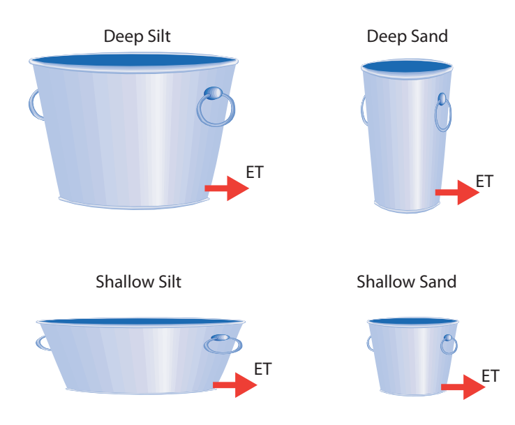
Figure 2. The water-holding capacity of the soil (AW, indicated by width), and the plant root depth (Rz, indicated by depth) dictate the size of the reservoir. Crop water requirements (evapotranspiration or ET) are roughly the same, regardless of soil type or depth.

amounts with more frequency as compared to surface (furrow), hand-line, or wheel-line irrigation systems. For this reason, fields converted to center pivot or drip irrigation systems often see increased crop uniformity and overall yields.