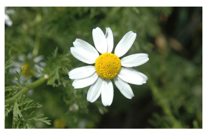
Figure 2. Mayweed chamomile flowers are 3/4- to 1-inch in diameter and usually have 10 to 16 white ray flowers surrounding a center of yellow cone flowers.