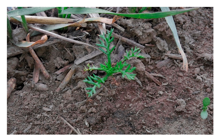
Figure 1. Mayweed chamomile seedling with cotyledons (plant on right) that quickly wither and are seldom seen by the time several true leaves emerge (plant in center).

Mayweed chamomile has a short, thick taproot. Mature plants grow to be 4 to 24 inches tall, are branched, and contain single flower heads, about 3/4-